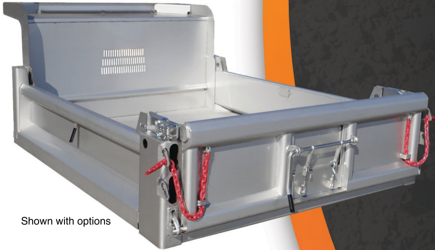
Shown with options