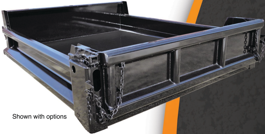
Shown with options