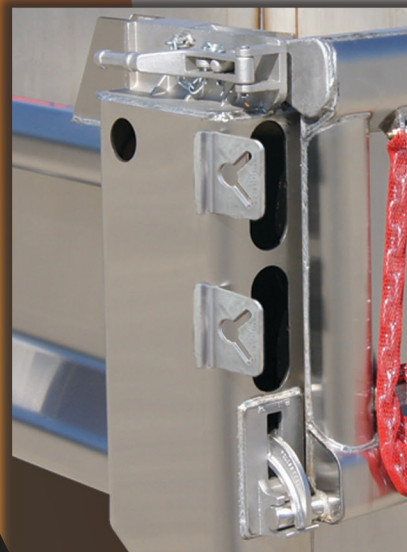
All hardware is stainless steel on the 133U body