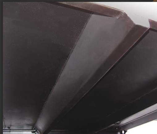
The Crossmemberless understructure of the 130U & 133U body uses 3/16" high tensile 7" or 9" trapezoidal longills.

Galion-Godwin Truck Body Co. LLC. 7415 Peabody-Kent Rd. Dundee OH, 44624 (877) 450-4794