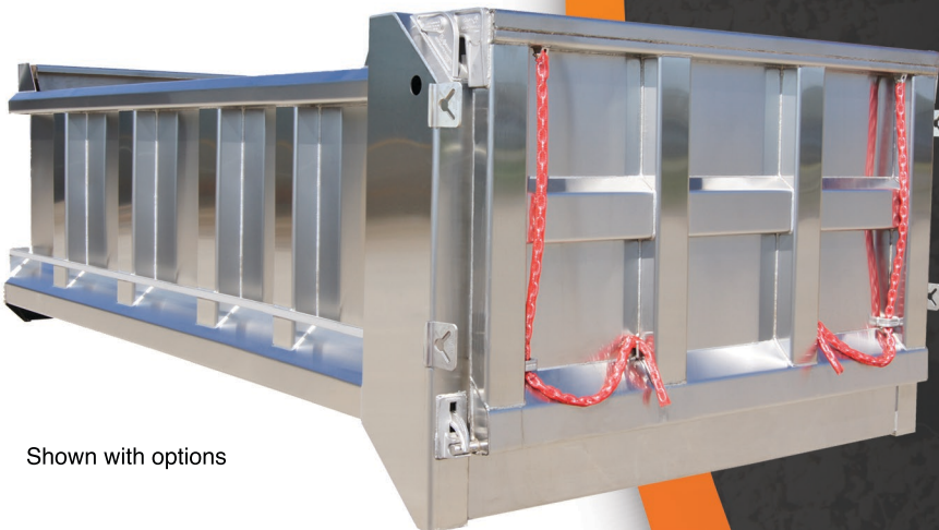
Shown with options