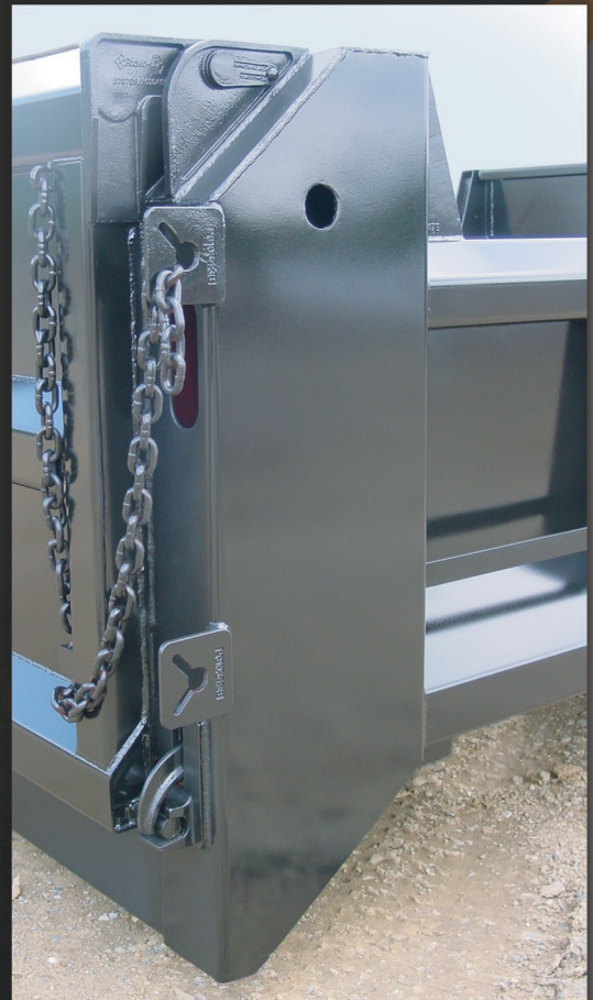
The 500U/T & 503U/T feature a 15" 7 gauge corner post and 10" deep rear bolster. Tailgate hardware is tarp friendly

Galion-Godwin Truck Body Co. LLC. 7415 Peabody-Kent Rd. Dundee OH, 44624 (877) 450-4794